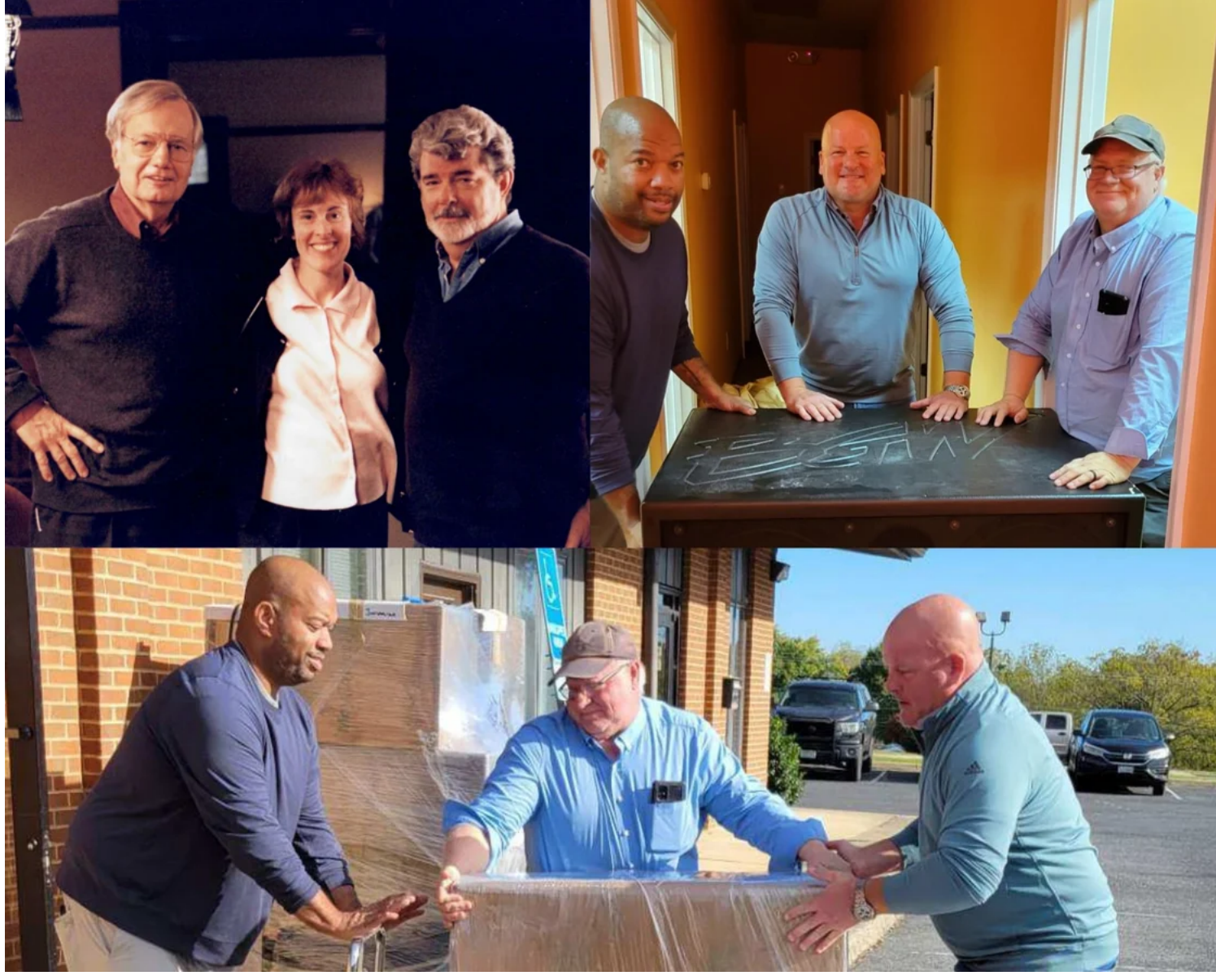
A surround sound system, destined for our renovated movie theater, is donated by George Lucas.