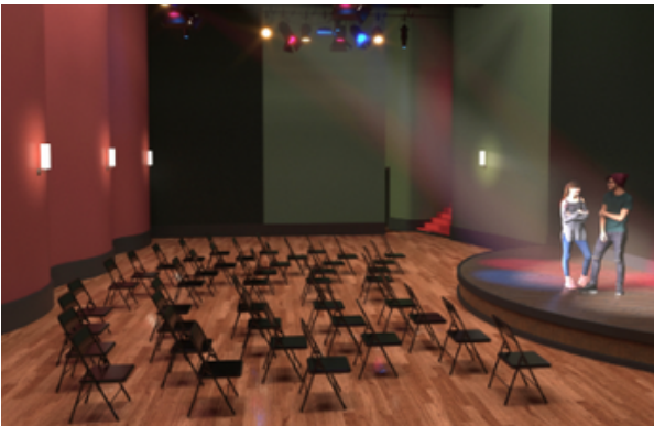
Architectural renderings of the performance space (above) and café (below)

This restoration will allow the Arcadia Project to turn the historic theater into a sustainable, adaptive mixed-use facility featuring: a movie theater; an event space to host conferences, events, and performing arts; digital media classrooms; and a small specialty food café. This project seeks to fill an untapped need in the community by delivering diverse creative, educational, and enrichment resources for the Staunton community.