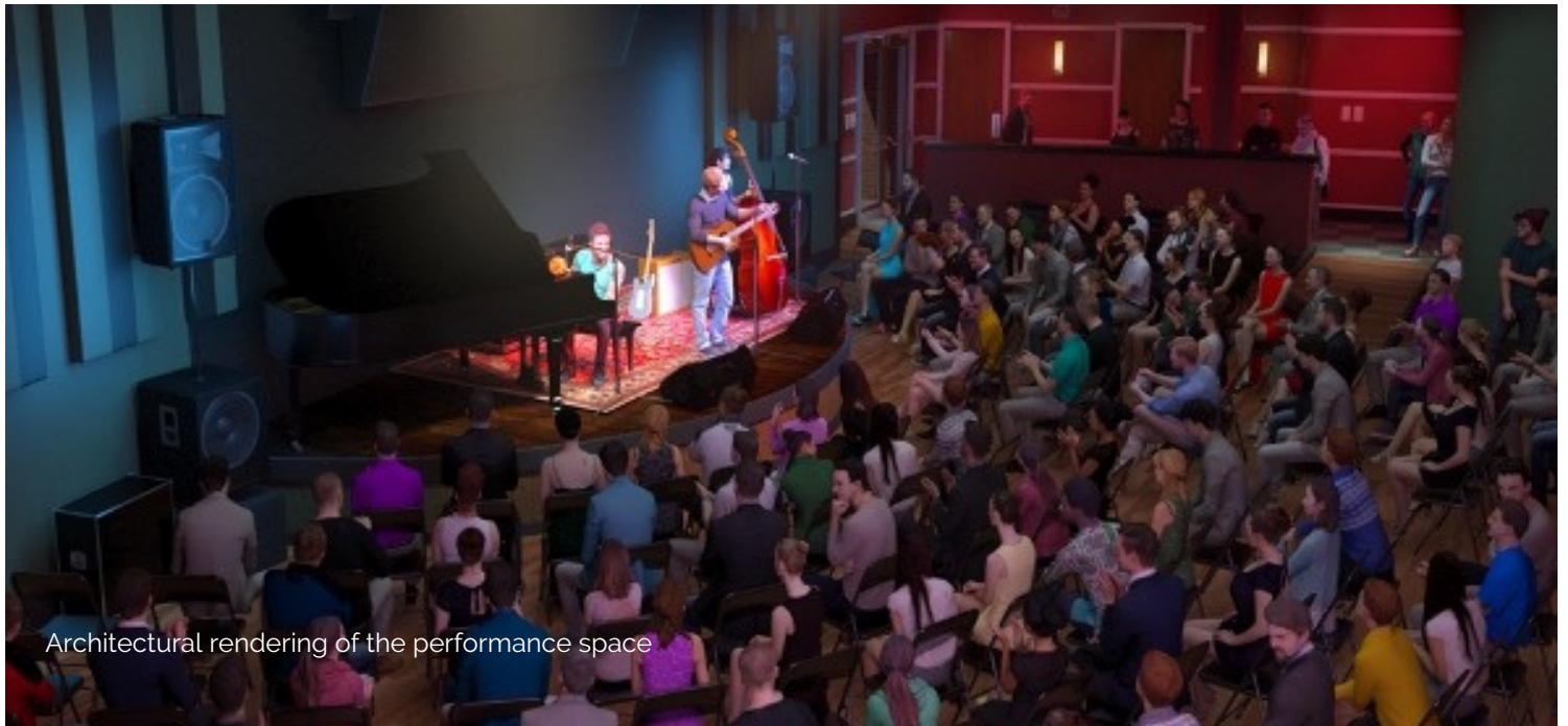
Architectural rendering of the performance space