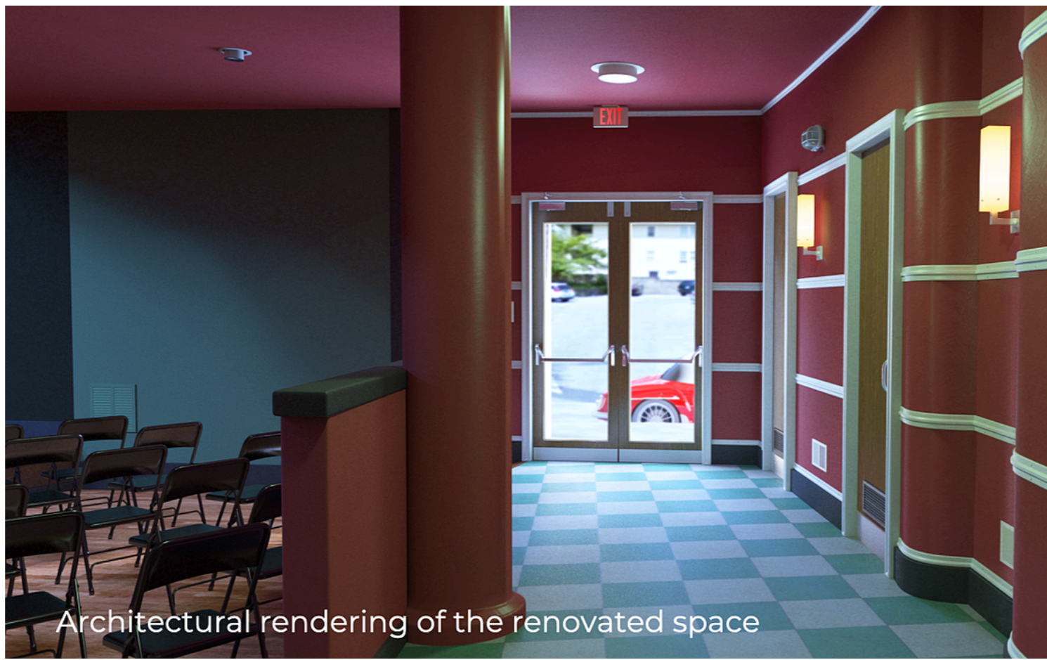
Architectural rendering of the renovated space

Transforming the former Dixie Theater is a multi-year process. It will become a mixed-use space for all of Staunton to create, experience, and perform thought-provoking work in many forms. With a place to share meaningful experiences and incorporate the history of the buildings and our community, we will revitalize an important block in our city.